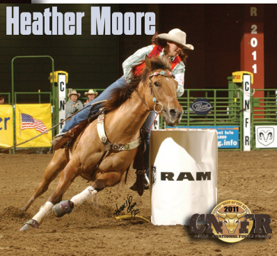
2011 College National Finals Men's and Women's Teams